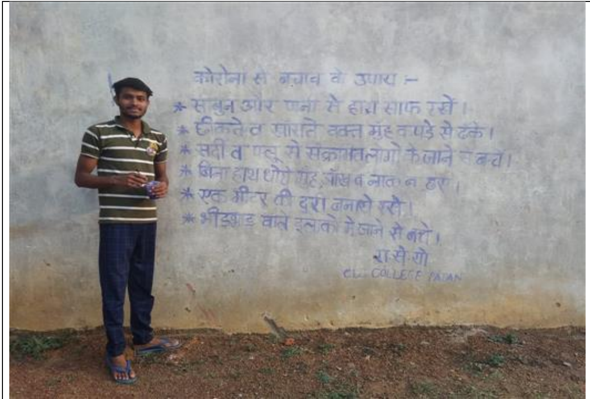
NSS student did the wall painting Awareness Campaign against Corona (Covid-19)