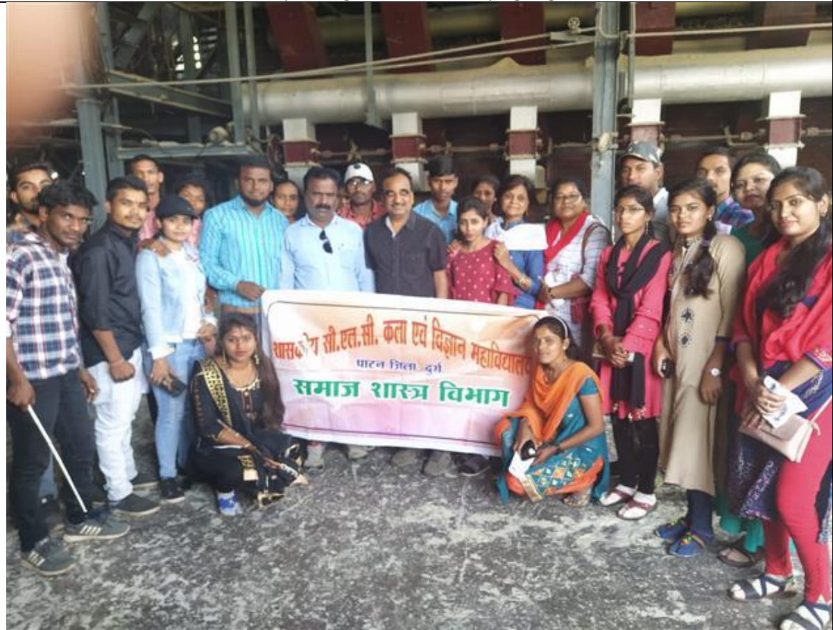
Department of Sociology went on Study tour (Bhoramdev Sugar Mills) jointly with Sociology