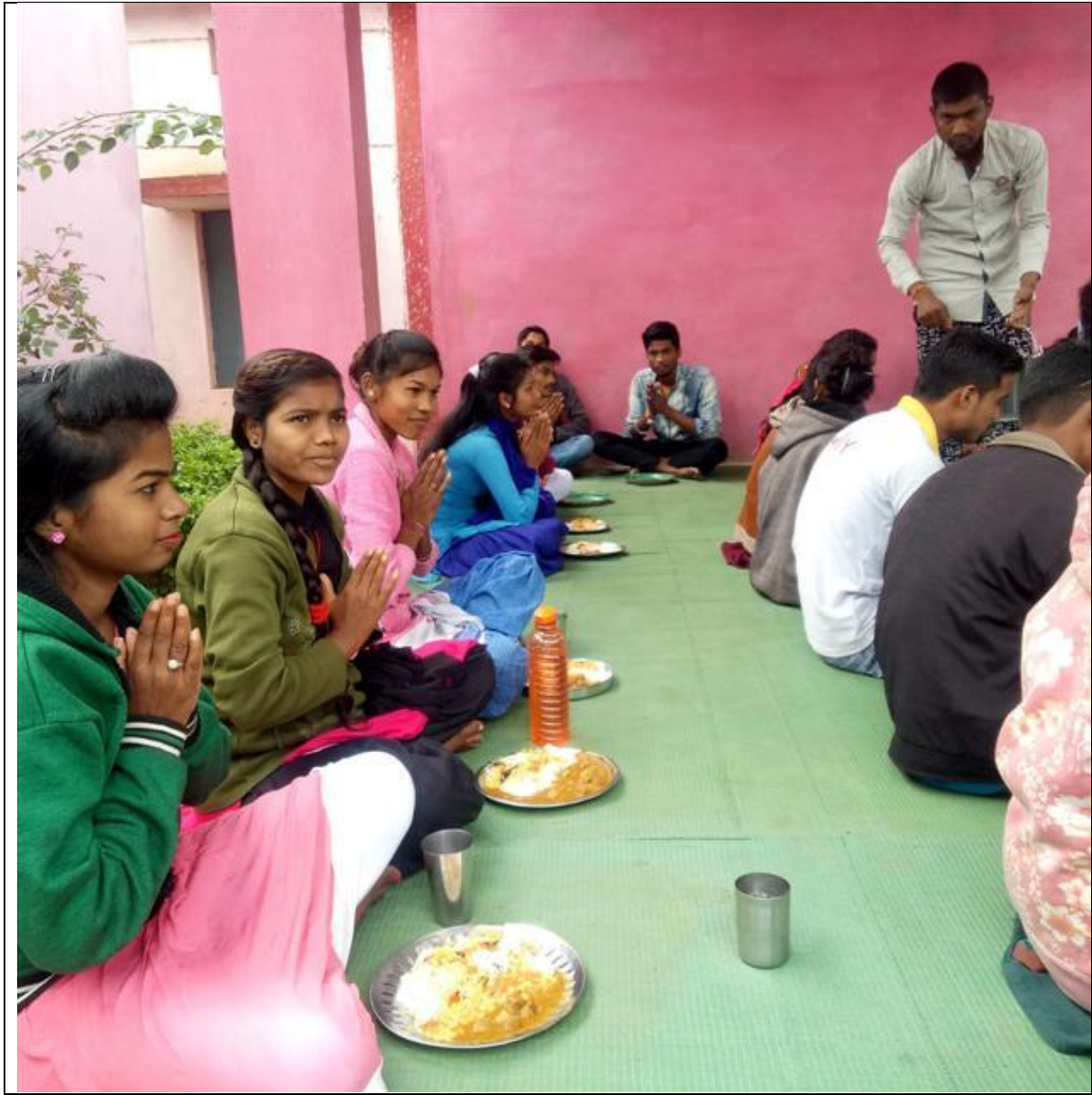
NSS student are praying before taking meals, in a 7-days special Camp