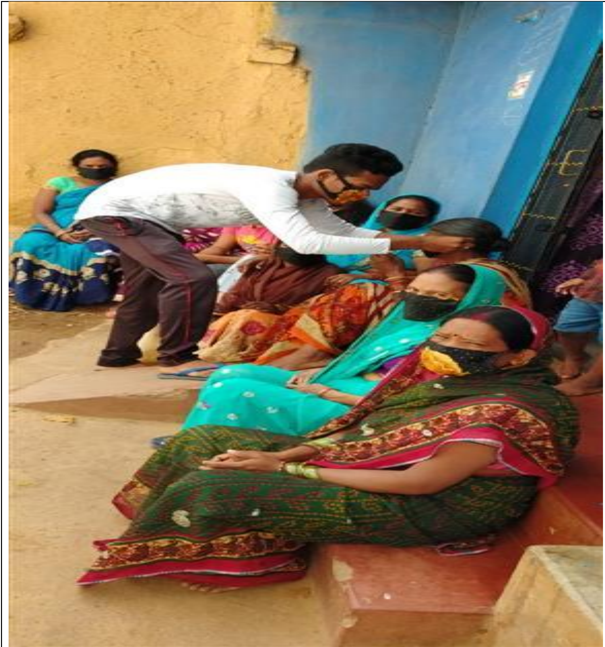
A NSS student made home mask from his sewing machine, and wore it to rural women