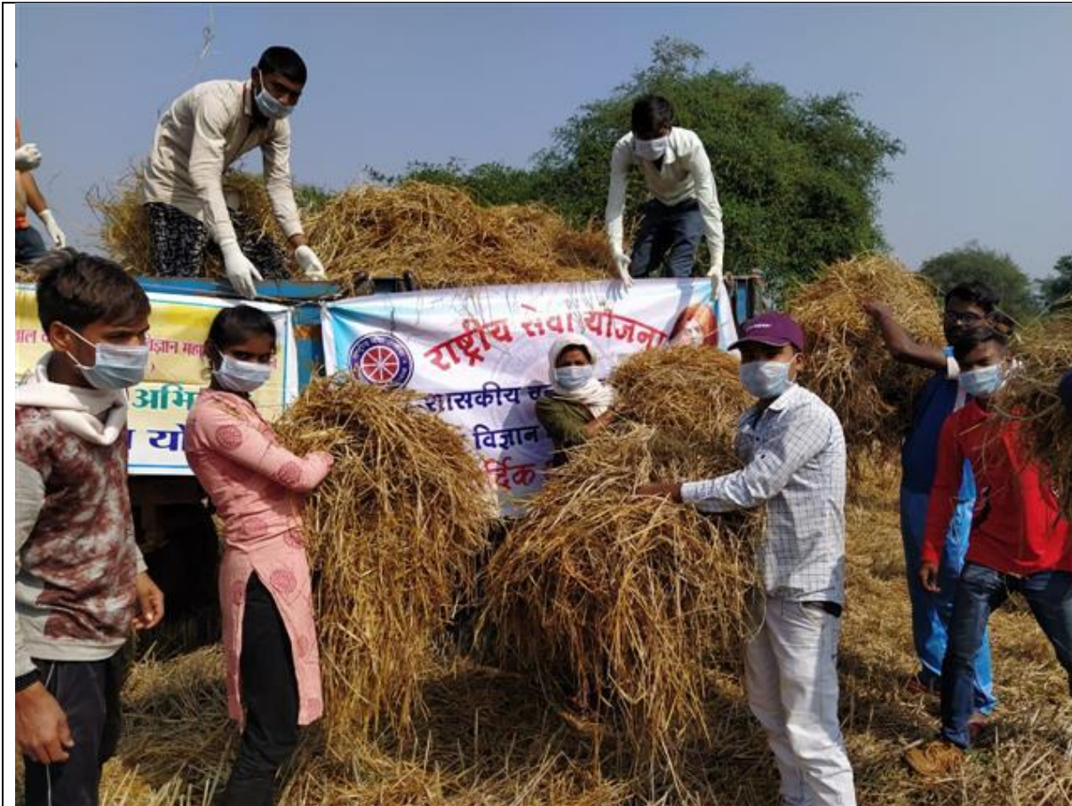
In Chhattisgarh, the farmer take the Paddy Gross for their Cow. All NSS students are helping.