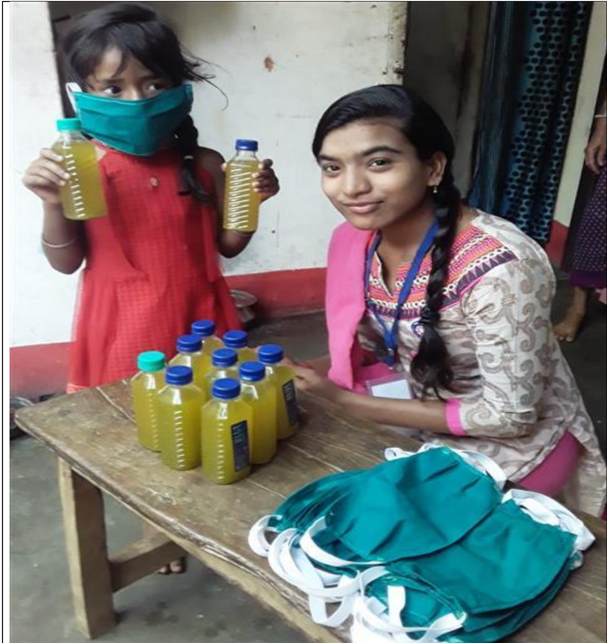
NSS student made home mask by her sewing machine and also sell the sanitizer.